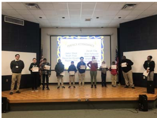
2nd Quarter Perfect Attendance