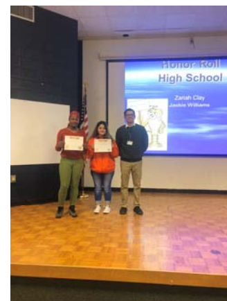
High School Honor Roll