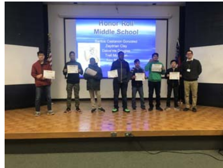
Middle School Honor Roll