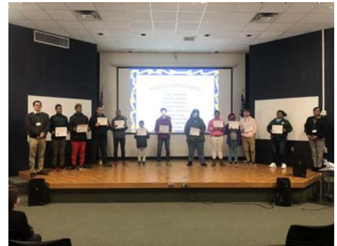
1st Semester Perfect Attendance