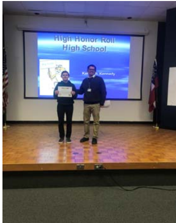
High School High Honor Roll