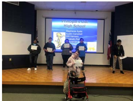
High School Principal's List