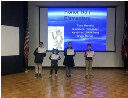
Elementary Honor Roll

Congratulations and keep up the good work!